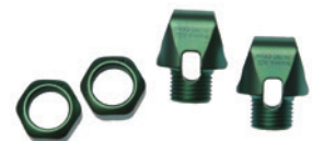
Cross connector clamp set